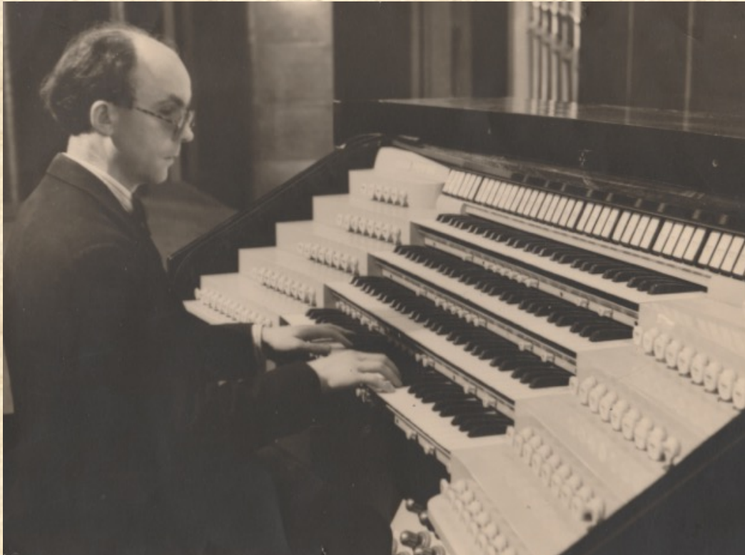
Jean Langlais in concert on the Cavallé-Coll/Gonzalez organ at the Trocadéro, June 27, 1943

And he didn't entrust the premiere of this work to anyone else. It took place on June 27, 1943 at the Palais de Chaillot (the Trocadéro Palace). A photograph from the time shows him during the concert on this monumental organ which he had played once before, two years earlier. 15