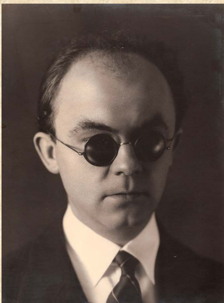
Jean Langlais, 1941

Dedicated to Gaston Litaize, this long work (over a half hour) remains probably the most technically difficult work in Langlais’ whole catalogue. The composer sets aside plainchant and modality, which had contributed so much to his success, and puts a blast of fresh air into a genre in which Widor and Vierne seemed to have said everything.