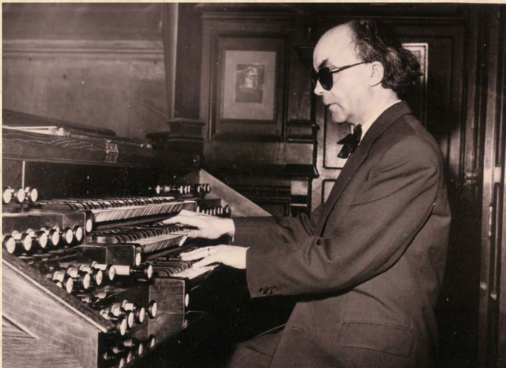
Jean Langlais at the console of Sainte-Clotilde, 1953

More than one critic expressed hope for a complete recording of the organ works of Franck from Jean Langlais, a project he would undertake 11 years later. 18 A photo taken at this time shows Jean Langlais at the organ of Sainte-Clotilde, concentrating intensely :