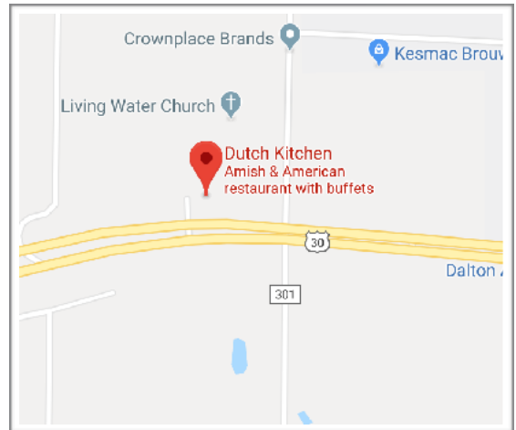
Das Dutch Kitchen Restaurant 14278 Lincoln Way E, Dalton, OH 44618