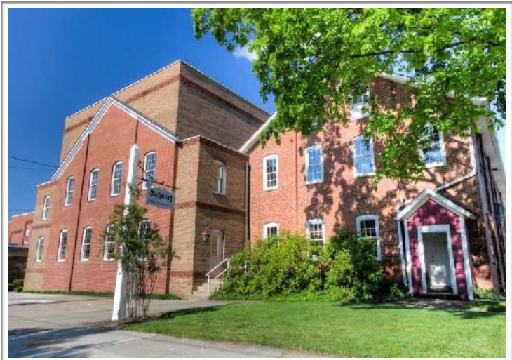
Schantz Organ Company 626 S Walnut St, Orrville, OH 44667