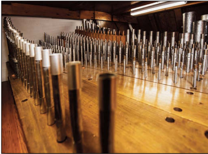
Swell division, level three