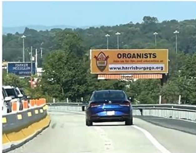
Billboard as seen from busy intersection.