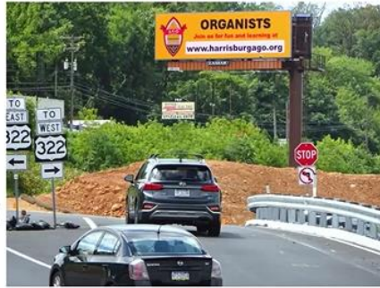
Harrisburg Chapter of the American Guild of Organists